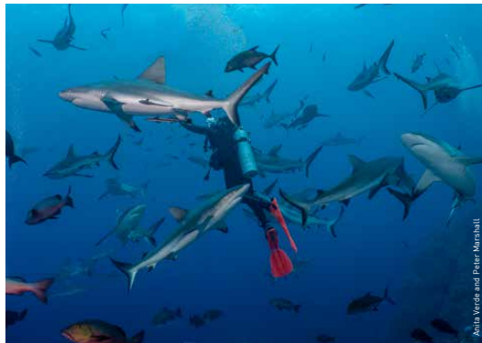
Diving with grey reef whalers, silvertip, and whitetip reef sharks at North Horn, Osprey Reef in Queensland, Australia